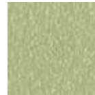
Sage Green Steel