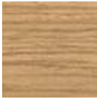
Lacquered veneered wood