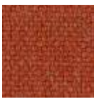
Cotton Club fabric