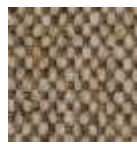
Main Line Flax fabric