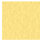
Pastel yellow steel