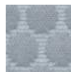
Bubble fabric 14 Colors