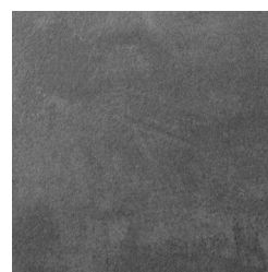
Dark grey structure (HPSDG)

For further questions, please contact info@cane-line.com or visit Cane-line.com