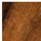
Veneered flamed walnut