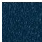
Ocean blue steel