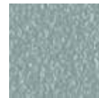
Light blue steel