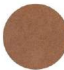
C3M2 (UTM) Marrone Brown