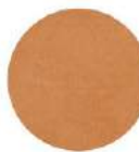
C3M2 (UTN) Naturale Hide