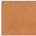
Tuscan hide 3 Colors