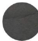
C3M4 (UTB) Nero Black

Tuscan Hide does not fear to get aged since the oldest it gets the more unique it becomes.