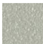
Light grey steel